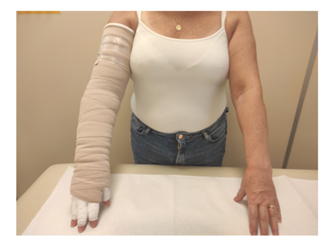
Figure 2. Patient with compression bandages.

In the CB group, multi-layer bandaging of the limb was performed using short-stretch bandages with pads (Rosidal K, Lohmann & Raucher, Poland ). At the beginning of bandaging, a cotton tube stockinet was placed on the arm, and a layer of gauze was applied to the fingers and hand. A layer of foam padding (Lymphset: Lohmann & Raucher) was placed on the hand and wrapped around the arm. Three bandages of different sizes (8, 10, and 12 cm in width) were placed around the limb with the first starting at the hand, the second at the wrist and the third beginning below the elbow (Figure 2).