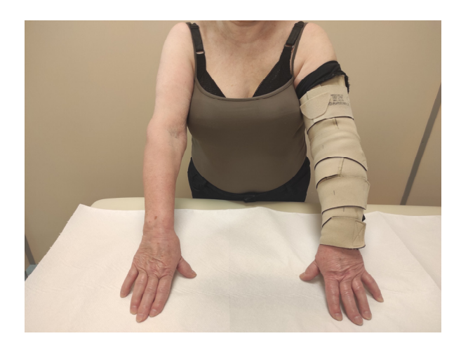
Figure 1. Patient with adjustable compression wrap.

In the CB group, multi-layer bandaging of the limb was performed using short-stretch bandages with pads (Rosidal K, Lohmann & Raucher, Poland ). At the beginning of bandaging, a cotton tube stockinet was placed on the arm, and a layer of gauze was applied to the fingers and hand. A layer of foam padding (Lymphset: Lohmann & Raucher) was placed on the hand and wrapped around the arm. Three bandages of different sizes (8, 10, and 12 cm in width) were placed around the limb with the first starting at the hand, the second at the wrist and the third beginning below the elbow (Figure 2).