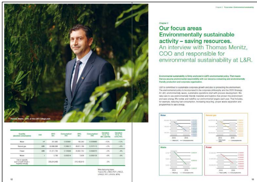
Caption: A look inside the first sustainability report published by the L&R Group.